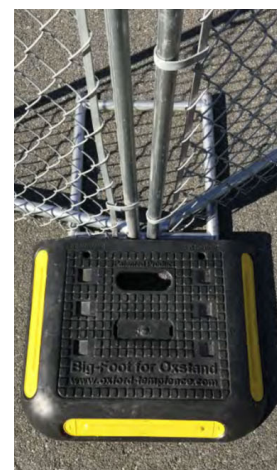
Hi-Visibility Base Weight